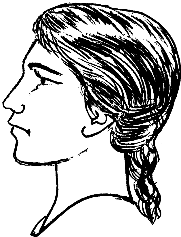
Kapitan Mi Stage 9, Decodable KalanguyaCommunity Living