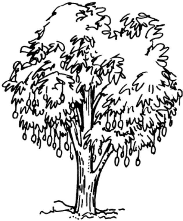
Hota Kiyew Level 2 (Grade 1) KalanguyaAgriculture