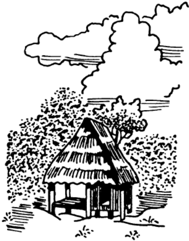
Hota da Wadad Ligligan Stage 8, Decodable Kalanguya Environment