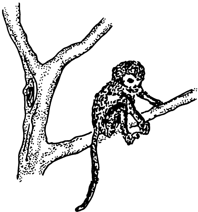
Anak a ak-ki