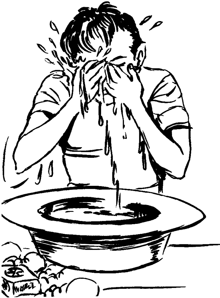
Manghilam-os. Gamit ang sabon ug tubig.