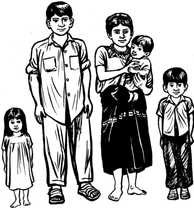
Malipayon kaayo ang pamilya Villa.