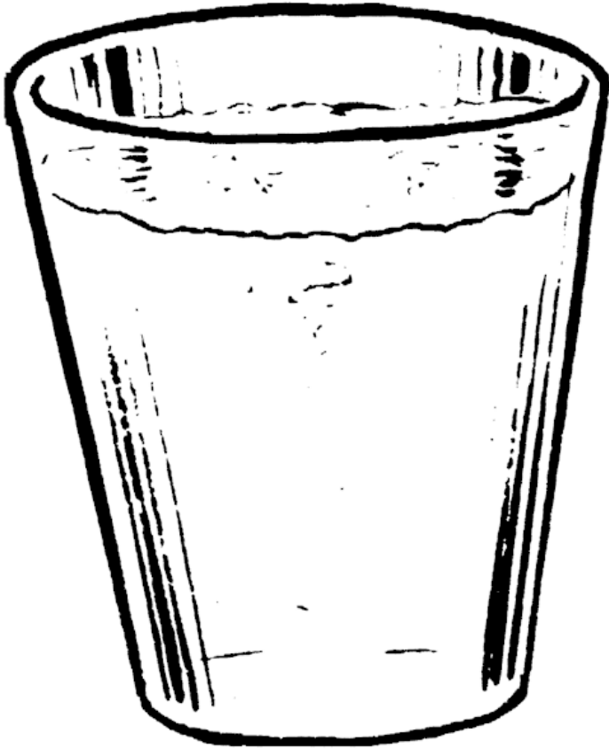
Gatas sa baso.