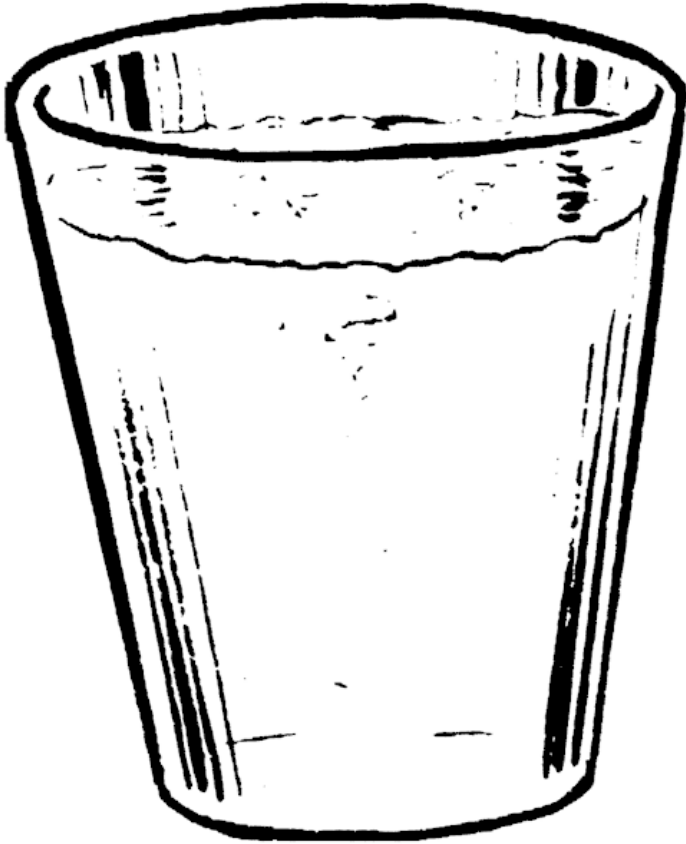
Ang baso may gatas.