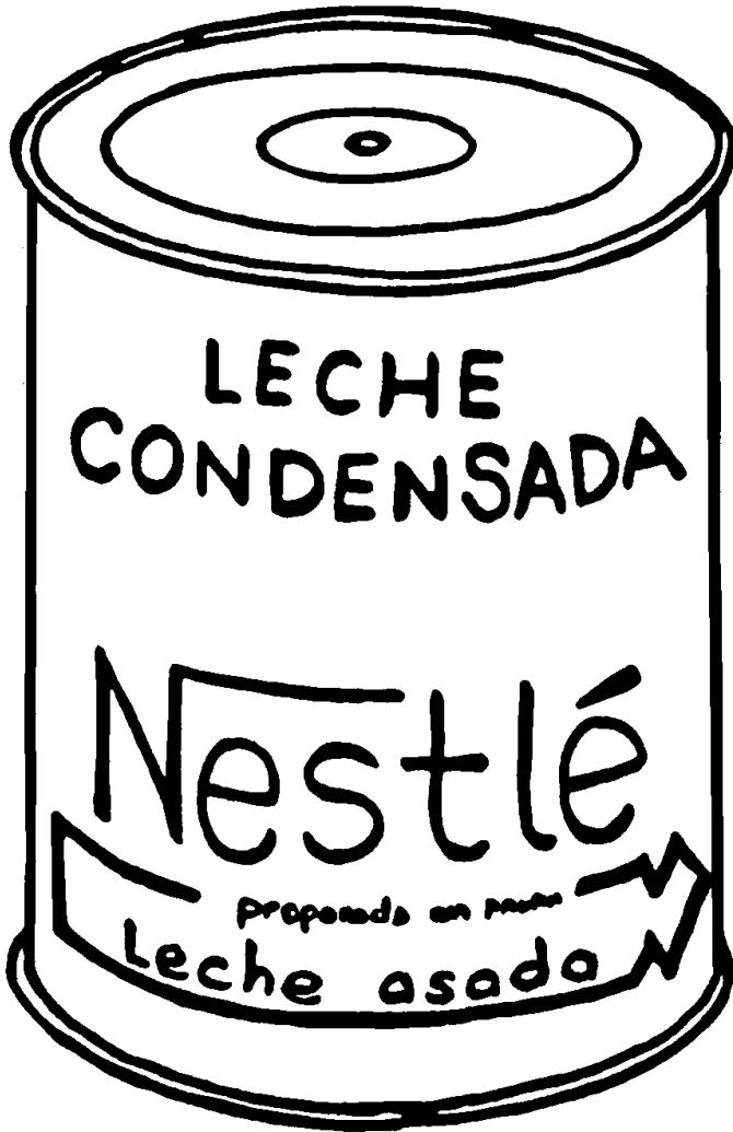
Lata sa gatas.