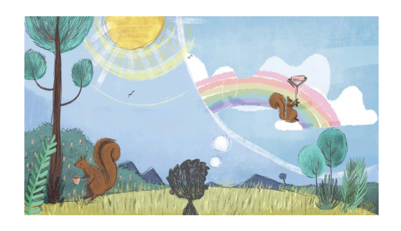
Oh no! Then who coloured the clouds?