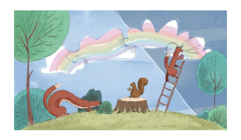
Oh no! Then who colored the clouds?