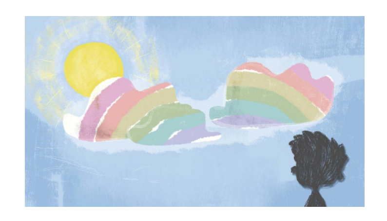
Who colored the clouds? Author: Weaam Ahmed Illustrator: Yomna Ebrahem