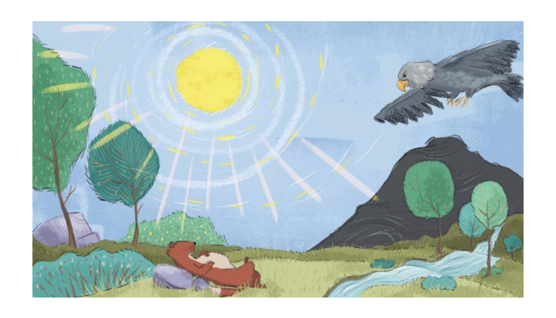
Oh no! Then who colored the clouds?