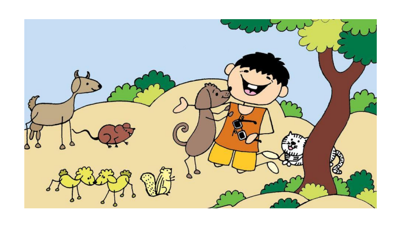
मेरे कुछ दोस्त ऐसे भी हैं जनिकी... पूँछ भी है।