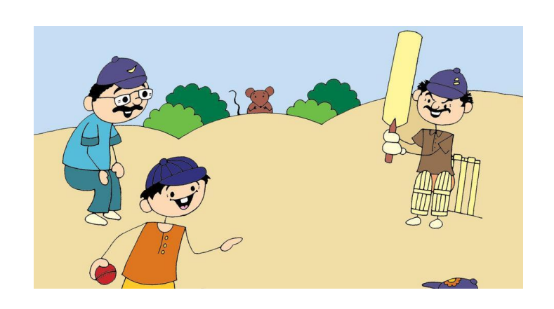
मेरे कुछ दोस्त बड़े-बड़े हैं। और...