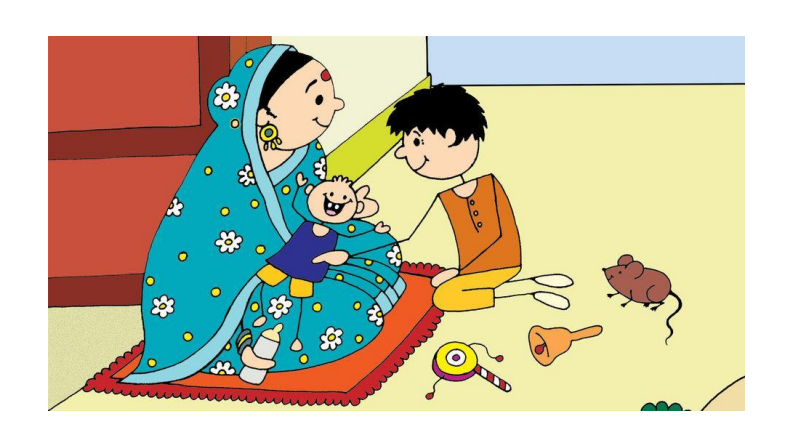
और... कुछ नन्हे-मुन्ने भी हैं।