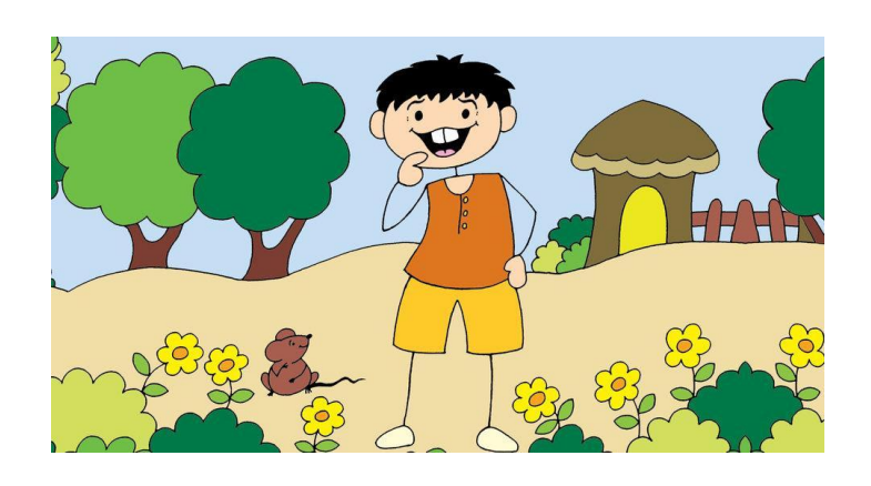
लेकिन, मेरा सबसे अच्छा दोस्त कौन है? कौन? कौन? कौन?