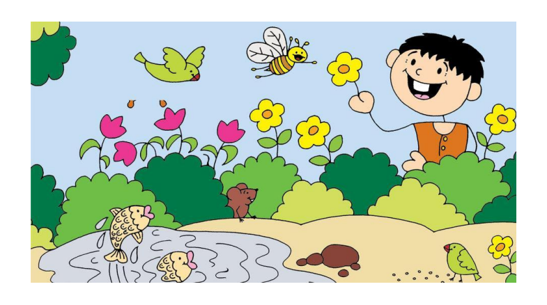
मेरे कुछ दोस्त उड़ते हैं। और कुछ दोस्त तैरते भी हैं।