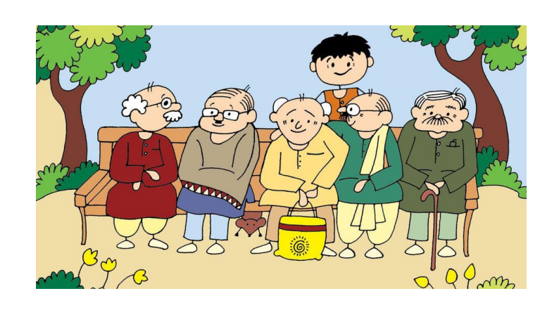
मेरे कई दोस्त बूढ़े भी हैं।