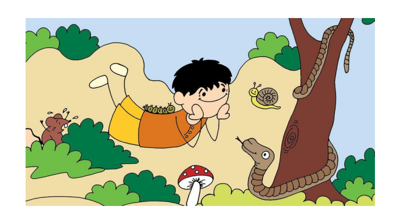
और कुछ ऐसे जनिके... पैर ही नहीं हैं।