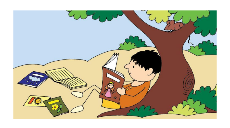
ओह! हो! कतािबें भी तो मेरी दोस्त हैं।