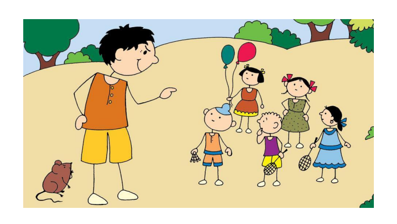
कुछ दोस्त छोटे हैं।