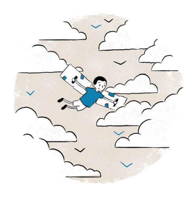
On Monday Thato thinks: Maybe I will get giant wings so I can fly high in the sky like a bird..."