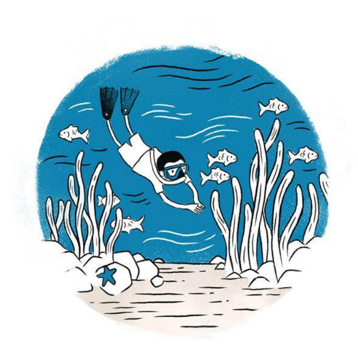
On Thursday Thato thinks: "Maybe I will get fins so I can swim under the water like a fish."