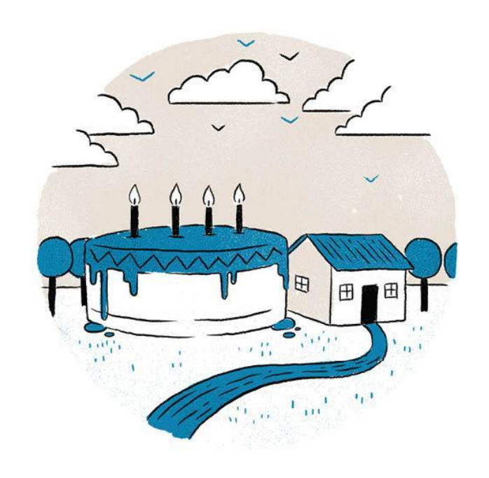
On Tuesday Thato thinks: "Maybe I will have a birthday cake as big as a house!"