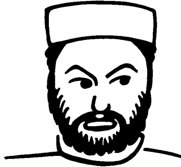
Jama'a da Al'adunsu Littafin karatu a saukake - Mataki na 4 Hausa