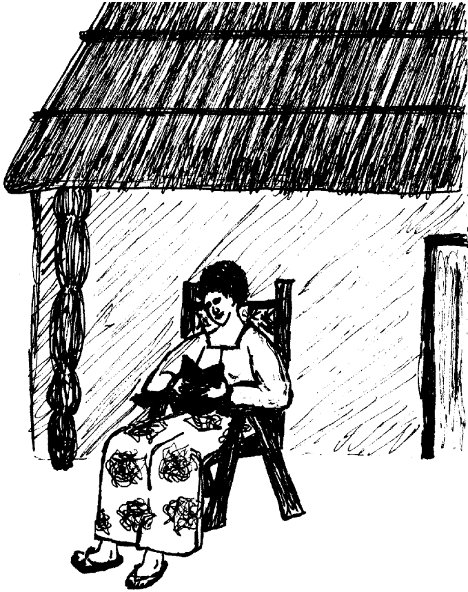
Hutawa Littafin karatu a saukake - Mataki na 1 Hausa