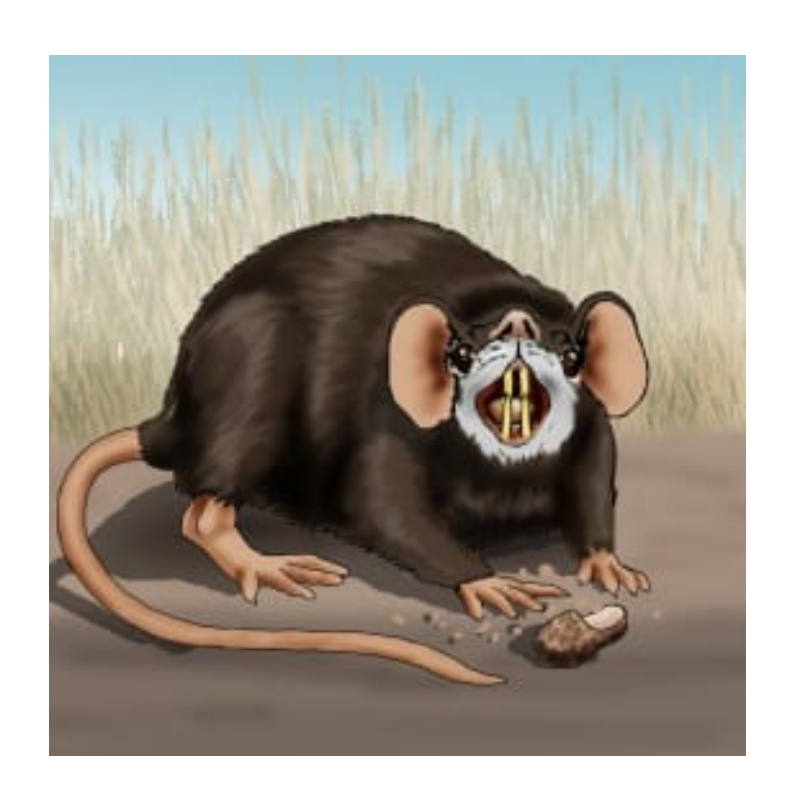
Rats have long front teeth.