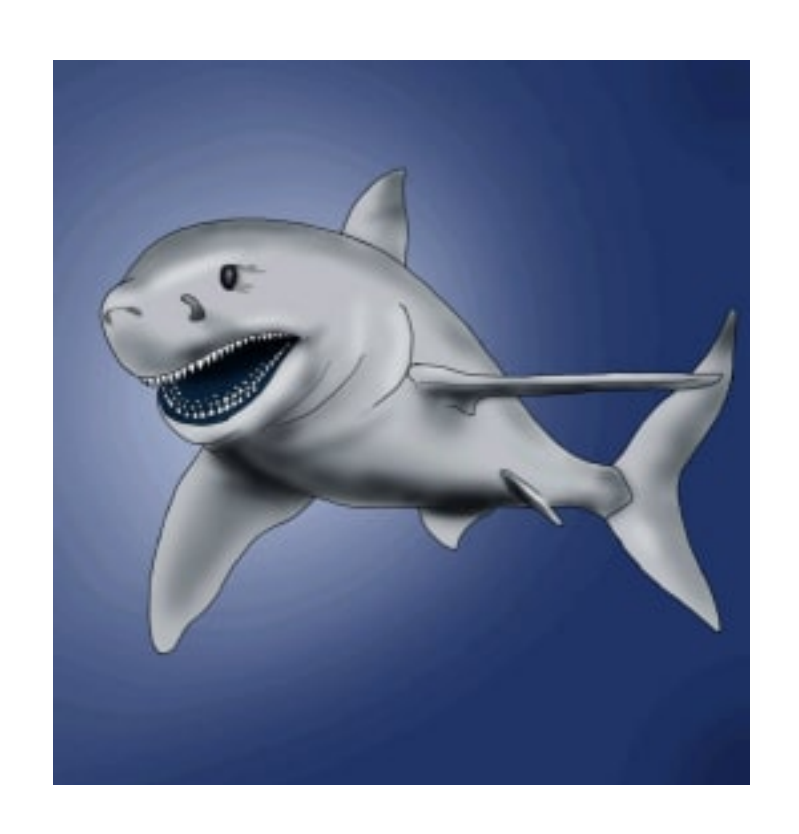
A shark has very sharp teeth!