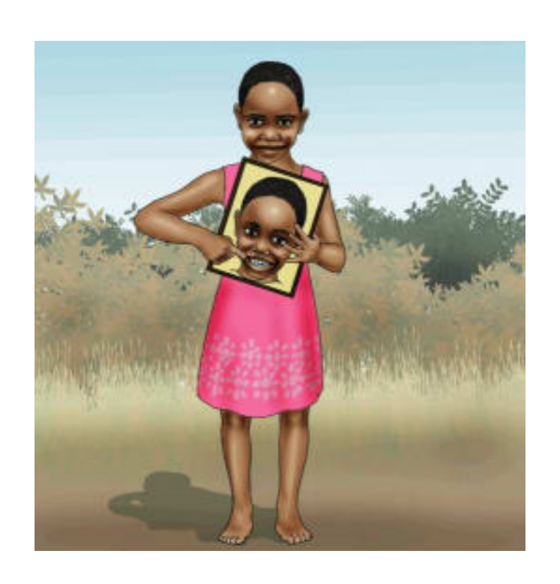
I used to have front teeth.