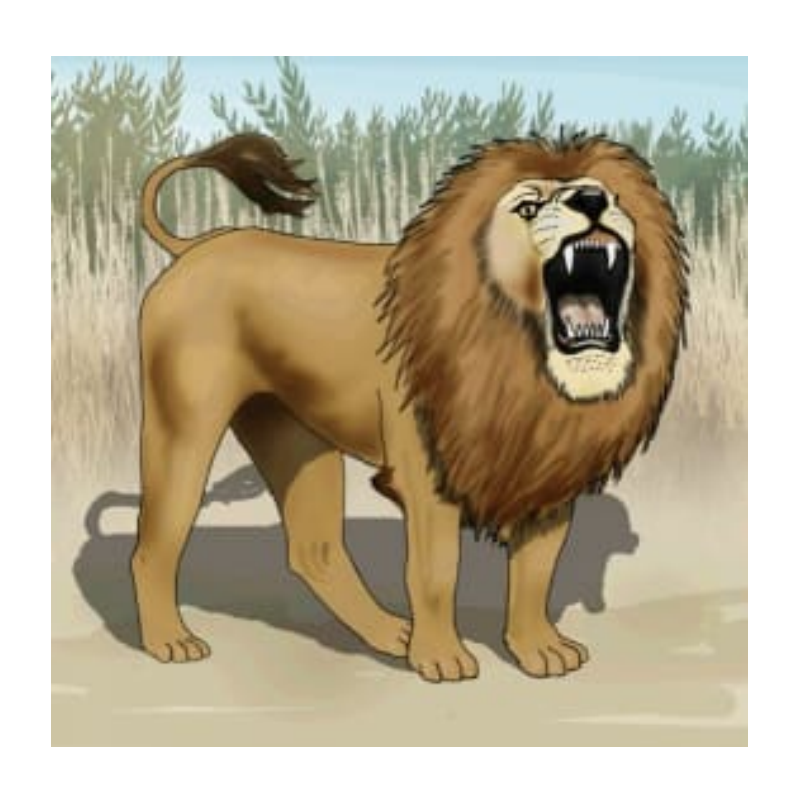
A lion also has sharp teeth.