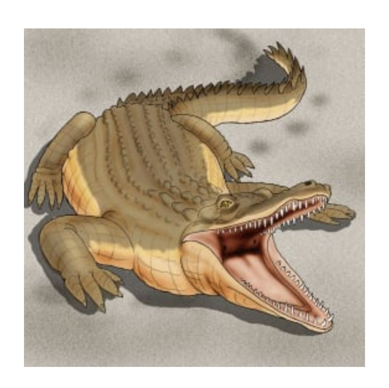
A crocodile has sharp teeth.